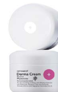
07 Phytoncide Derma Cream

Daily apply to cleansed and toned face and neck, even body as needed.