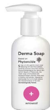
02 Phytoncide Derma Cream Soap

Fermented vitamin tree fruit which is rich in unsaturated fatty acid . It is rich in natural active ingredients and contains large amount of unsaturated fatty acids, mineral, terpene the nutrients needed for a body. The amount of vitamin-C in fermented vitamin tree is 530mg/100g, which is 265 times, 176 times and 5.8 times more than grapes, apples and lemons, respectively.