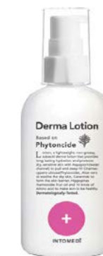
06 Phytoncide Derma Lotion

Moisten a cotton pad with the toner and spray directly on the face and neck. It can be used as a mist at any time of the day.