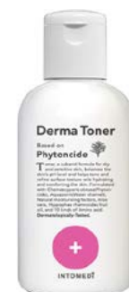
05 Phytoncide Derma Toner

Apply one pump to palm, make foam, gently massage, and rinse thoroughly.